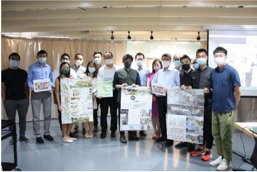
Prize money has been presented to the three winning teams on 28 Jul 2021.