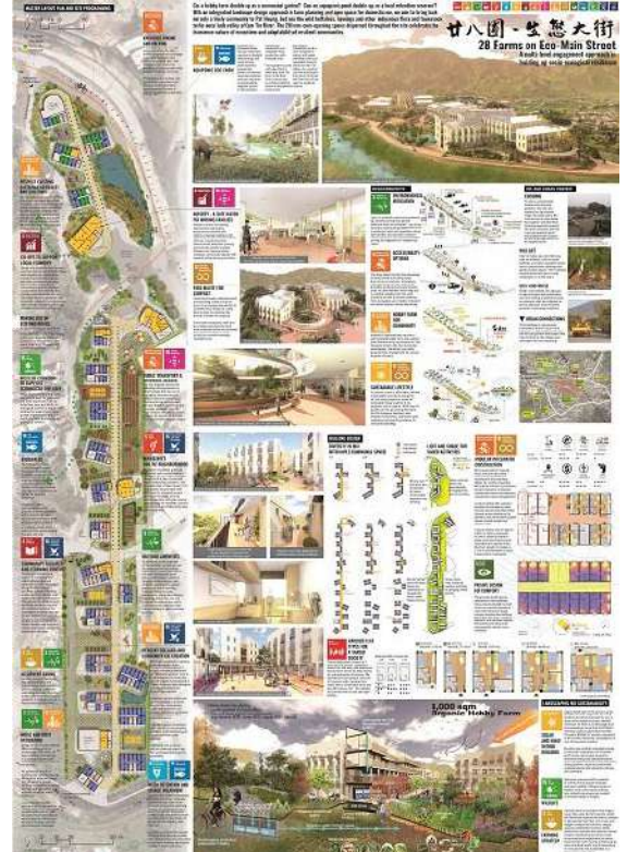
Second Prize (HK$90,000) 28 Farms Eco-Main Street 廿八圍 - 生態大街 — team led by LAM Lai Shun